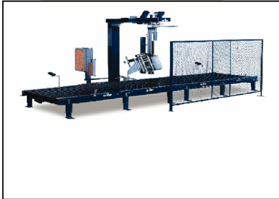
Fully automatic rotary tower stretch wrapper

Rotary tower machines can be placed over a weigh scale so that the load can be weighed and wrapped at the same time. They can also be placed over conveyors and other equipment for greater operational flexibility. During operation,