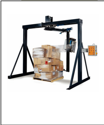
Rotary tower semiautomatic stretch wrapper

One user example is the Annex Warehouse, which ships 50 to 100 pallets of bulk coffee per day. General Manager Buzz Romero wanted to streamline manual stretch wrapping in order to free personnel for other duties and decrease the time drivers waited for consignments. Following an in-plant trial, Romero